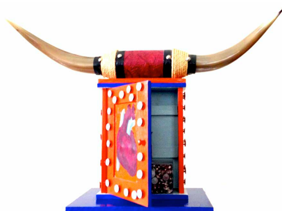
Magic Box with Banker Pondering Whether to Turn Cowboy , Mix media.

Most recently she organised the highly successful exhibition to celebrate the centenary of Salvador Dalí at the Palazzo Grassi in Venice (2004) The Colour of my Dreams: The Surrealist Revolution in Art , at the Vancouver Art Gallery (2011), and was Associate Curator for Manifesta 9 (2012). She has published standard works on photomontage, Dada, Surrealism, women artists and Mexican muralists.