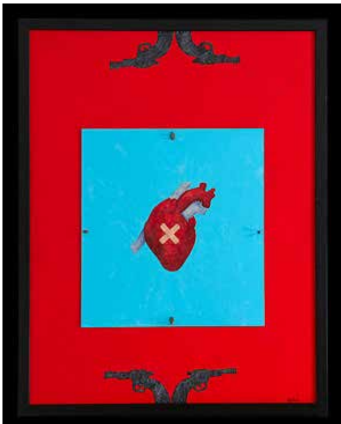
Attacking an Injured Heart , Mixed Media on canvas, 116x91cms, 2008